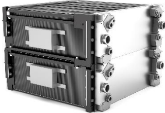
Image 3: Thanks to the type of material used and its innovative design, Freudenberg's fuel cell stack is specially designed to meet the requirements of heavy-duty applications, such as long service life and efficiency.